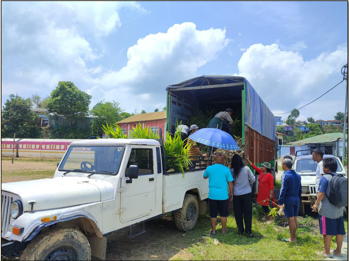
NATURAL RESOURCE MANAGEMENT Arecanut Seedling at Darlawn