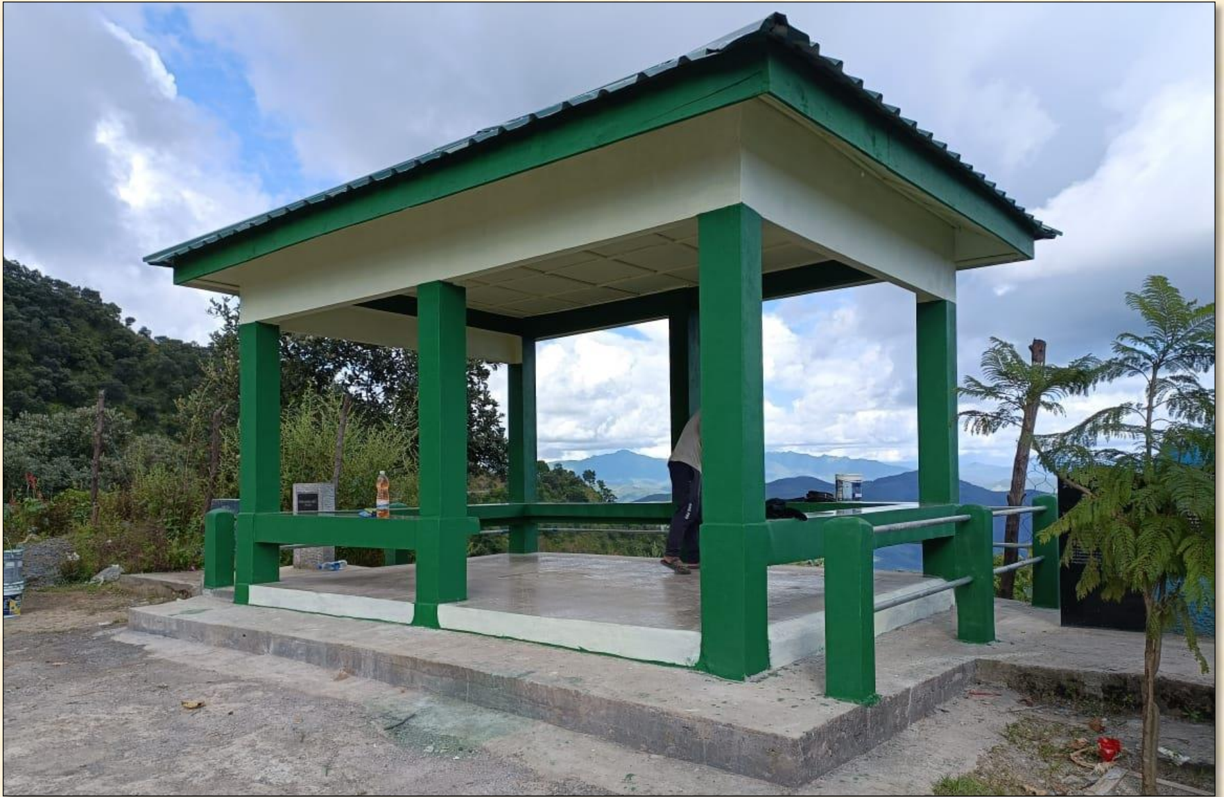
Entry Point Activity at Ngur. Estimate= ₹4.669 lakhs